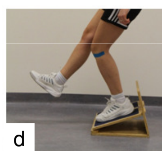
Figure 1: the four conditions tested in the study: a) control condition, b) patellar strap condition, c) sports tape condition and d) placebo condition